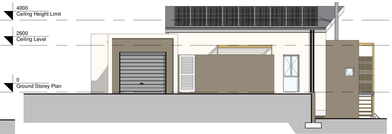
2 Side Elevation - 01 1 : 100