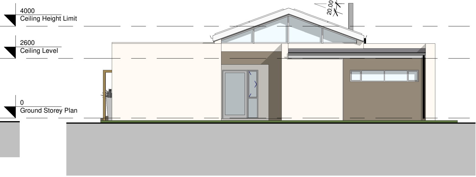
4 Street Elevation 1 : 100